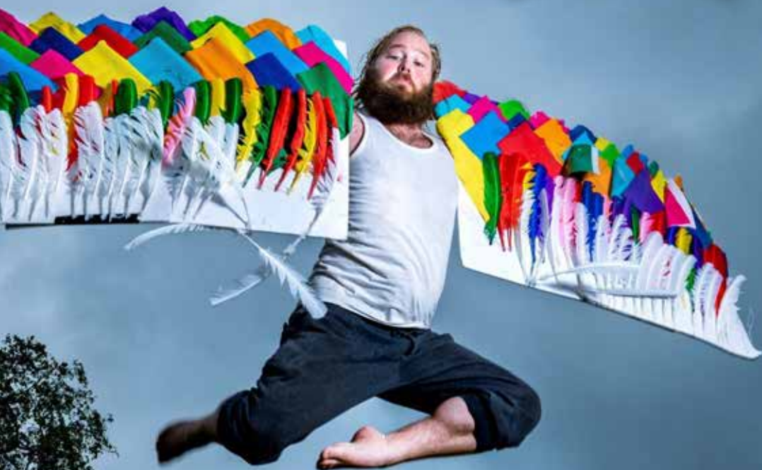
Learning to Fly